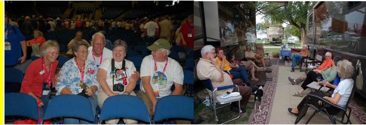
52 nd Escapade, Sedelia, Mo