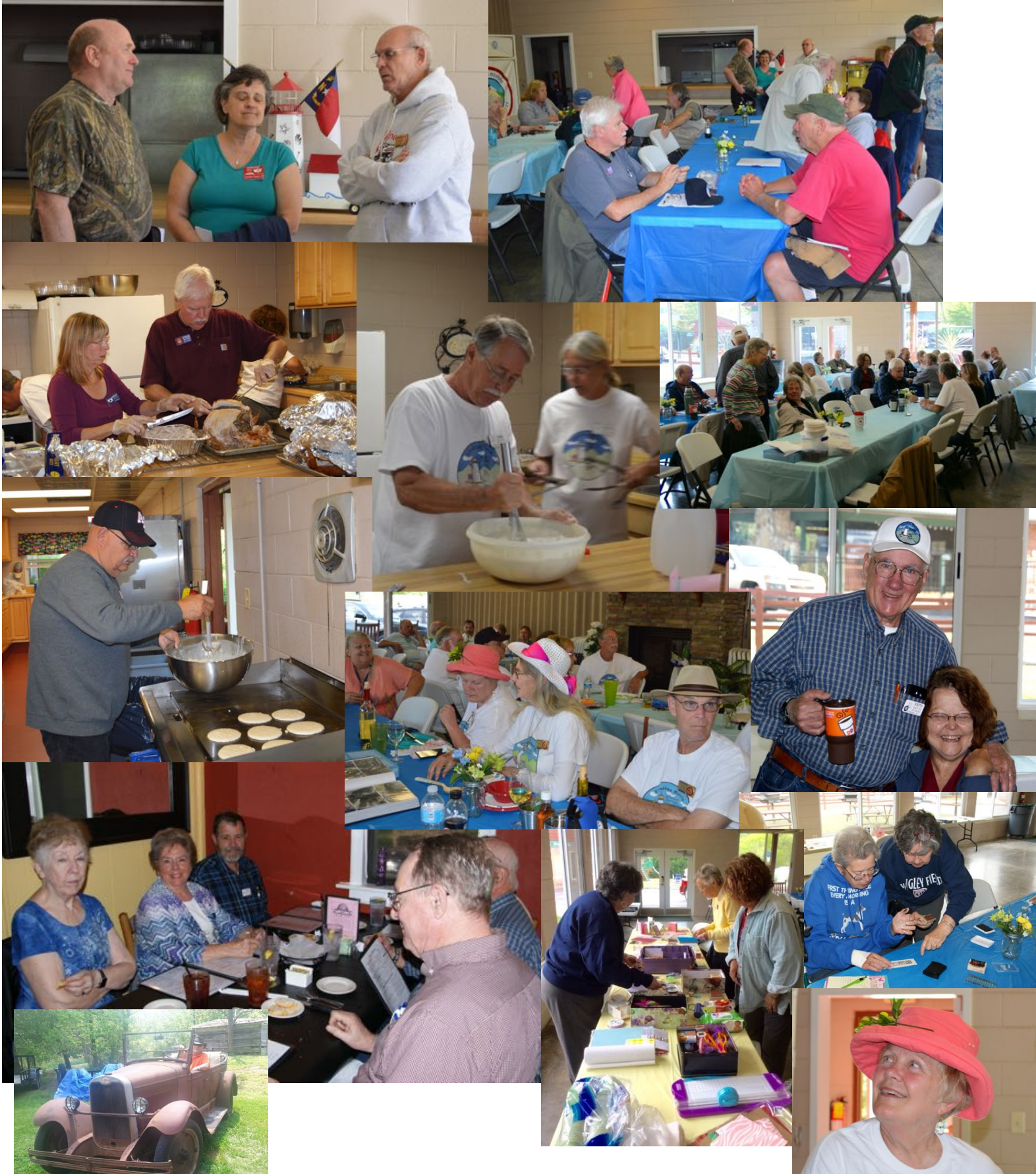
DILLARD OR BUST!