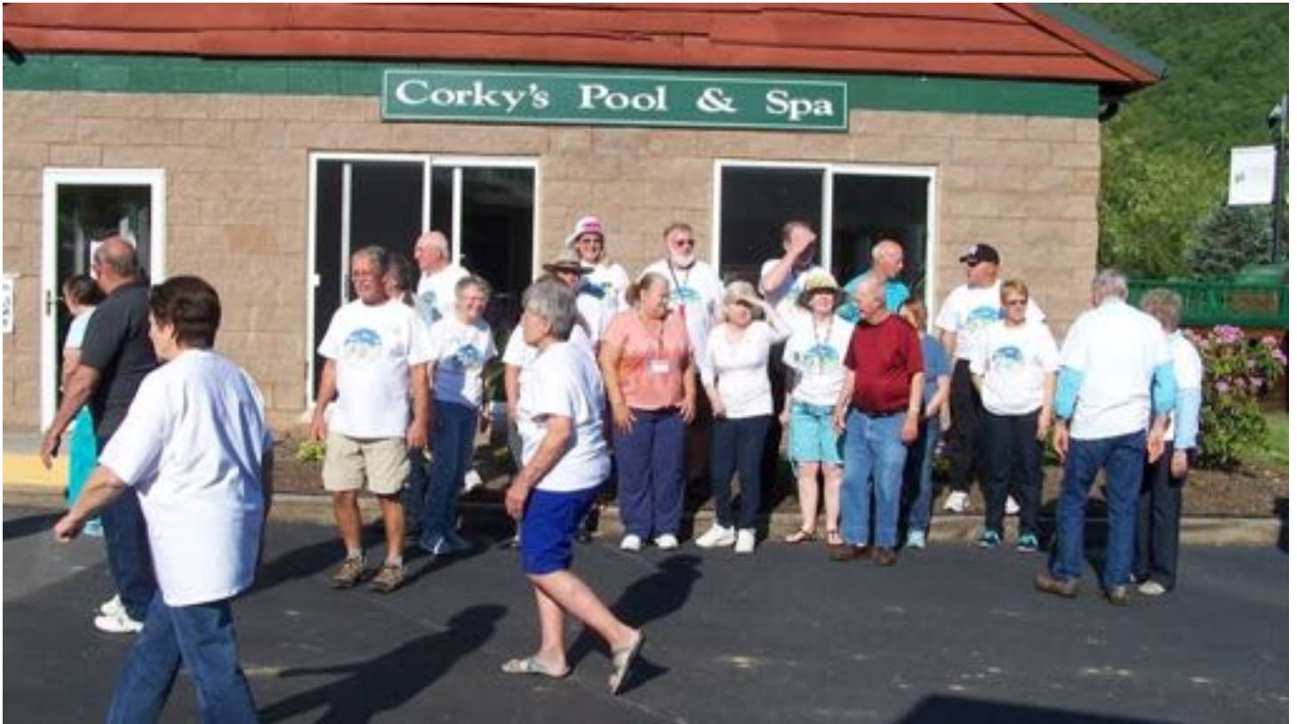
Getting a group picture is sort of like herding cats!