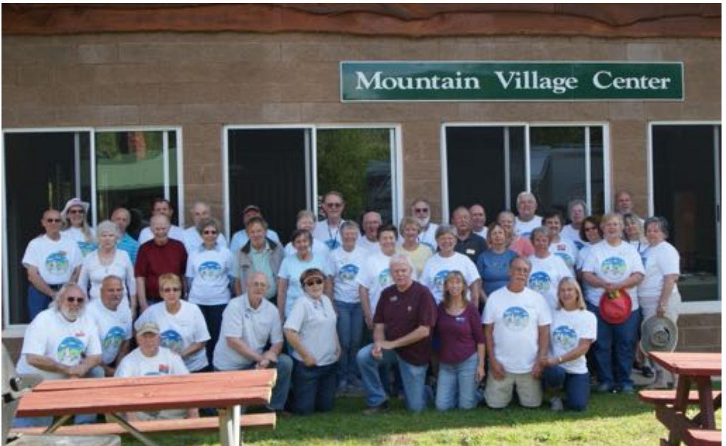
But we finally got a great shot!