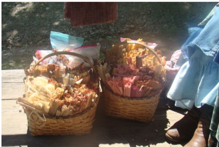
Dye'd corn husks used to make doll dresses.