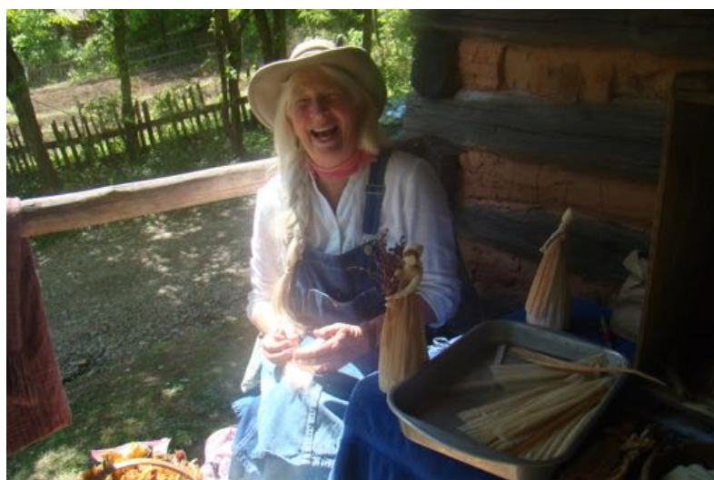
Lady making dolls out of corn husks