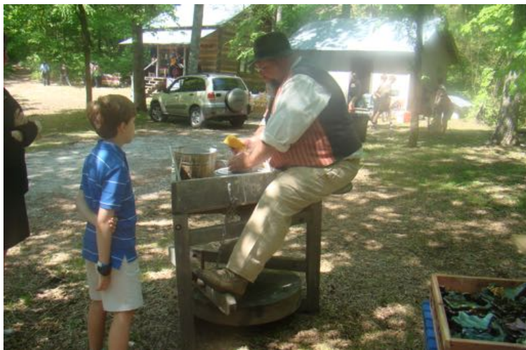
Wheel Potter at Foxfire: Makes various mugs and other things from local clay.