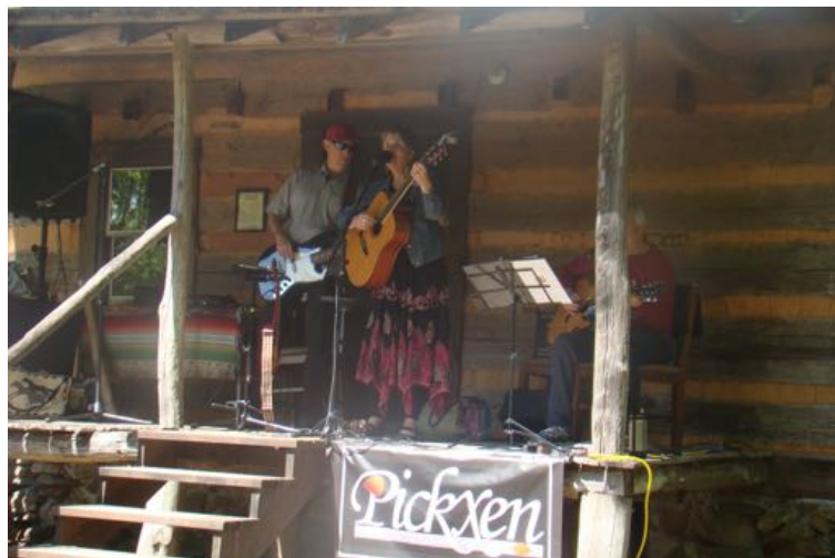
Live entertainment in area where they had Boy Scouts selling Burgers, Hot dogs, coleslaw, sodas, water, and very dry corn bread as a fund raiser for their troop.