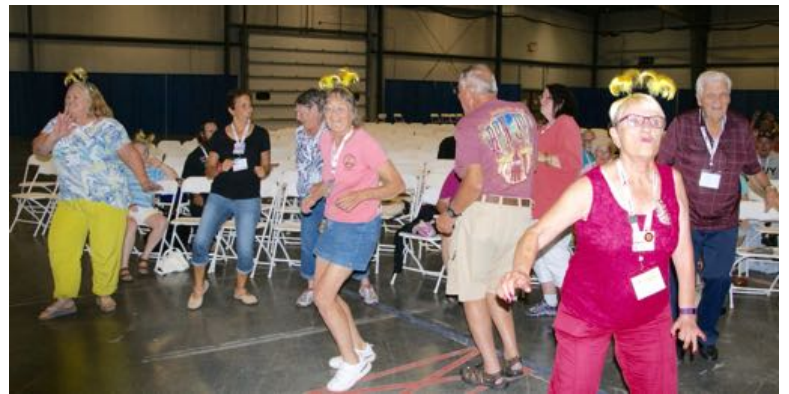
Solos having fun. Can you spot the Chapter 29 member?