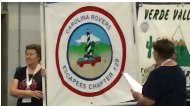
Parade of Banners