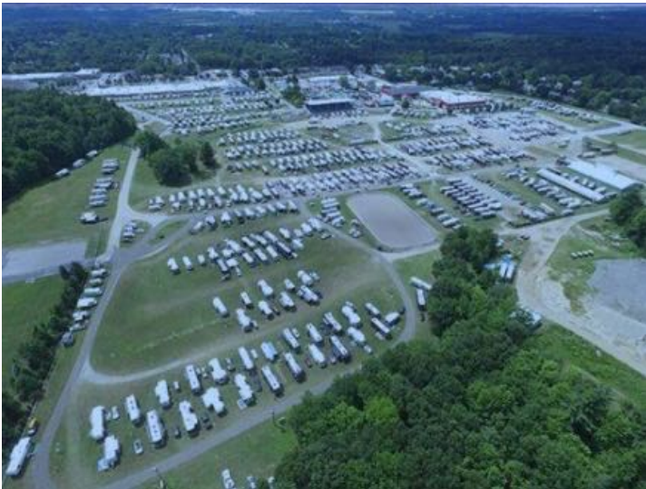
Arial View of The Champlain Valley Expo Center & fair grounds.