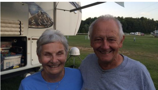
New Chapter 29 Members