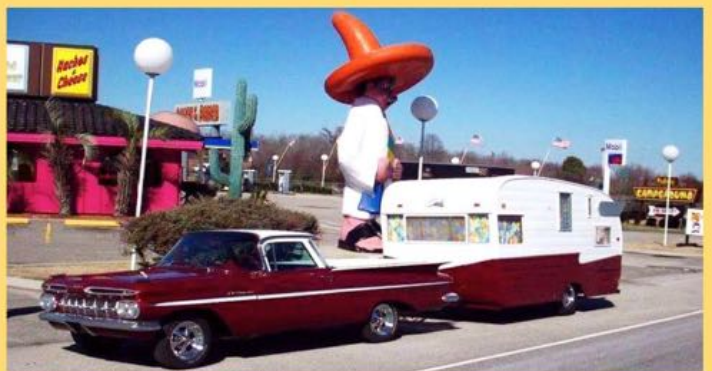
1959 Chevrolet El Camino with Shasta Travel Trailer