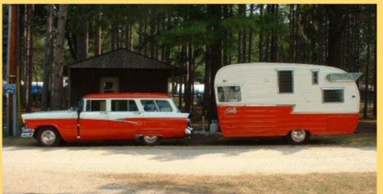
1955 Ford Customline Wagon with Shasta Trailer