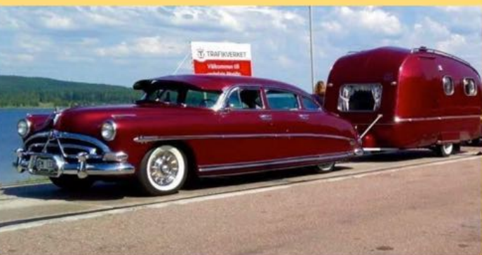
1951 Hudson Commodore with matching Trailer