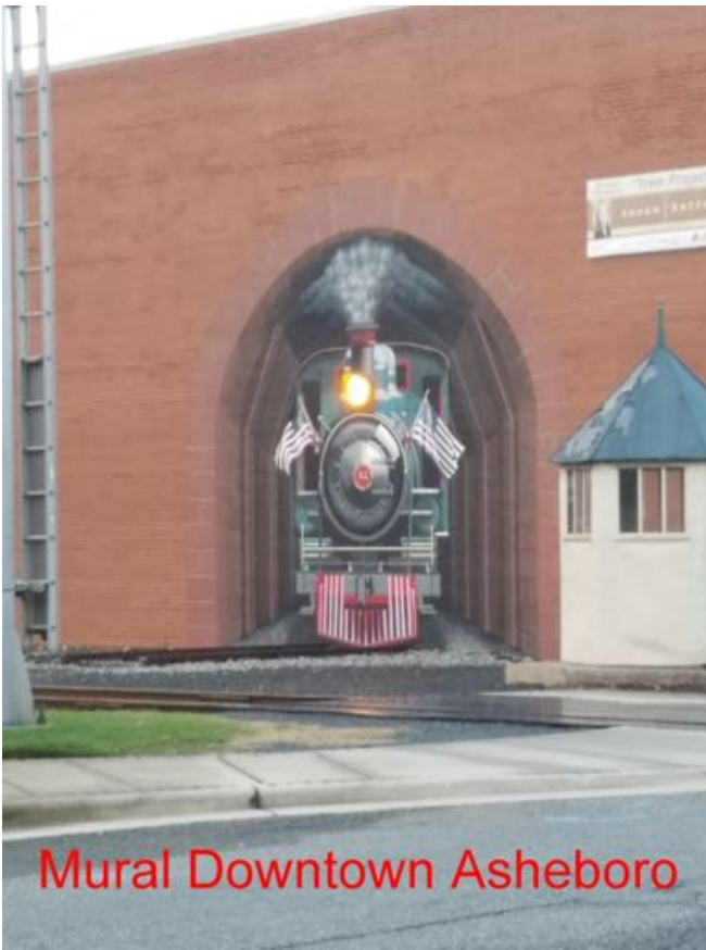
Mural Downtown Asheboro