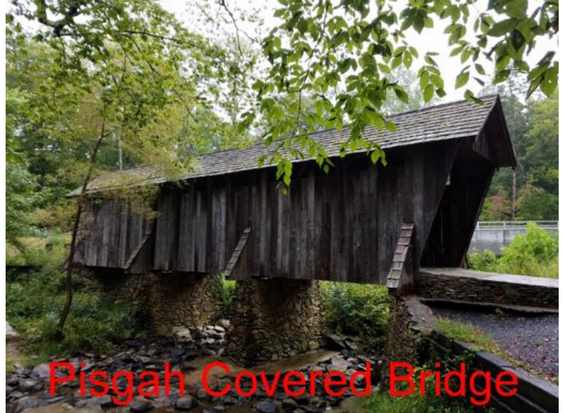
Pisgah Covered Bridge