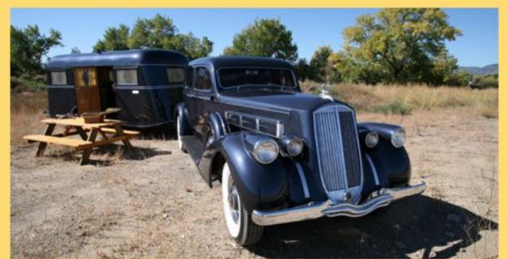
1936 Pierce Arrow with Travelodge