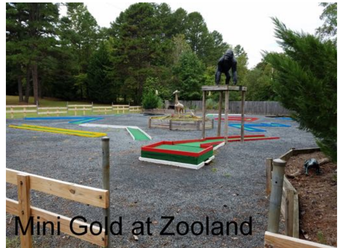
Mini Gold at Zooland