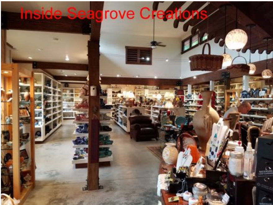
Inside Seagrove Creations