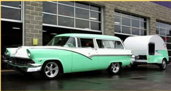
1956 Ford Ranch Wagon with Teardrop Trailer