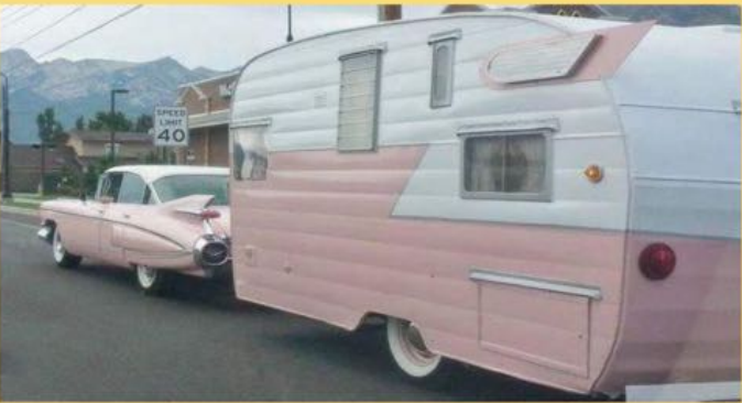
Pretty Pink Pair 1959 Cadillac Sixty with Shasta Trailer