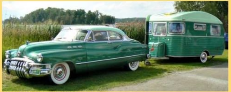
1952 Buick Riviera Hardtop with Matching Trailer