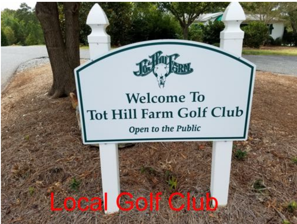
Local Golf Club

Don't delay - make your reservations TODAY!!!