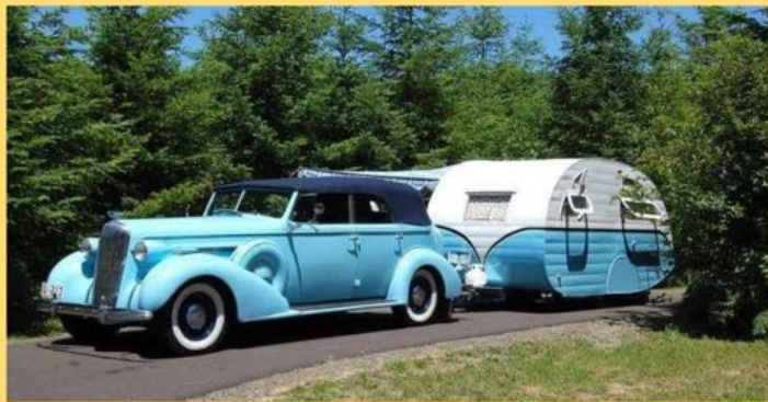
1935 Pontiac with Turquoise Canned Ham