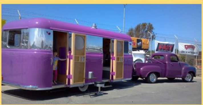
1949 Studebaker Pickup with Purple Trailer to Match