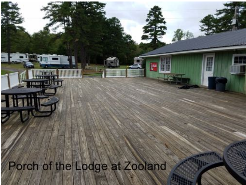
Porch of the Lodge at Zooland