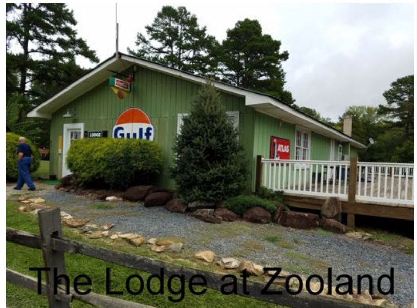
The Lodge at Zooland