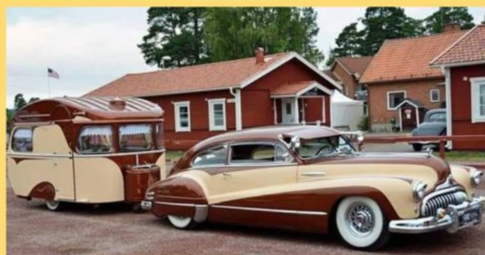
1947 Custom Buick Sedanet with Matching Trailer