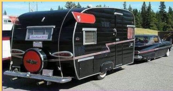
1959 Chevrolet Impala Hardtop with Shasta Travel Trailer