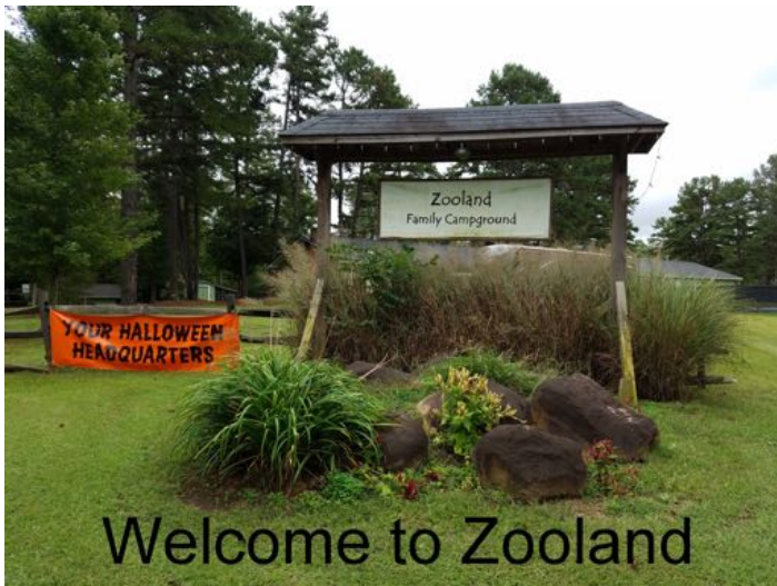
Welcome to Zooland