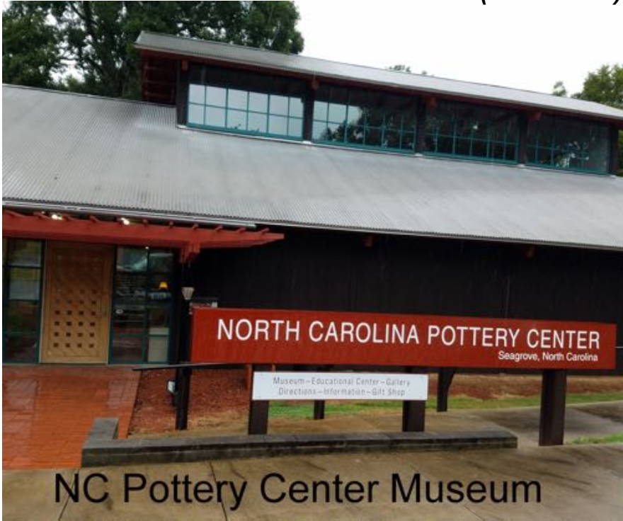
NC Pottery Center Museum