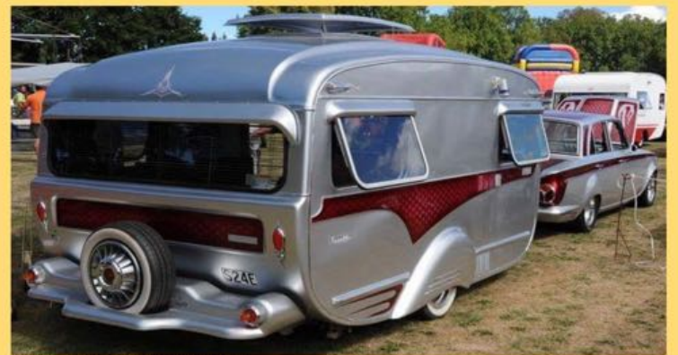
1962 Ford Cortina with Custom Travel Trailer