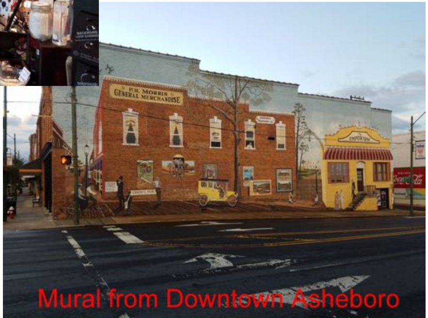
Mural from Downtown Asheboro