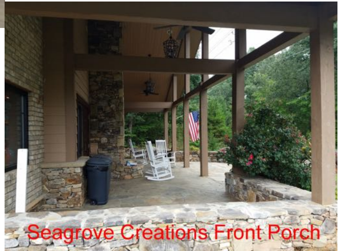
Seagrove Creations Front Porch