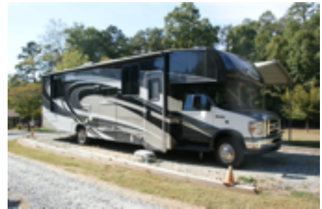
319MB FLOORPLAN Premier - Ford 450

Many more pictures available on request.