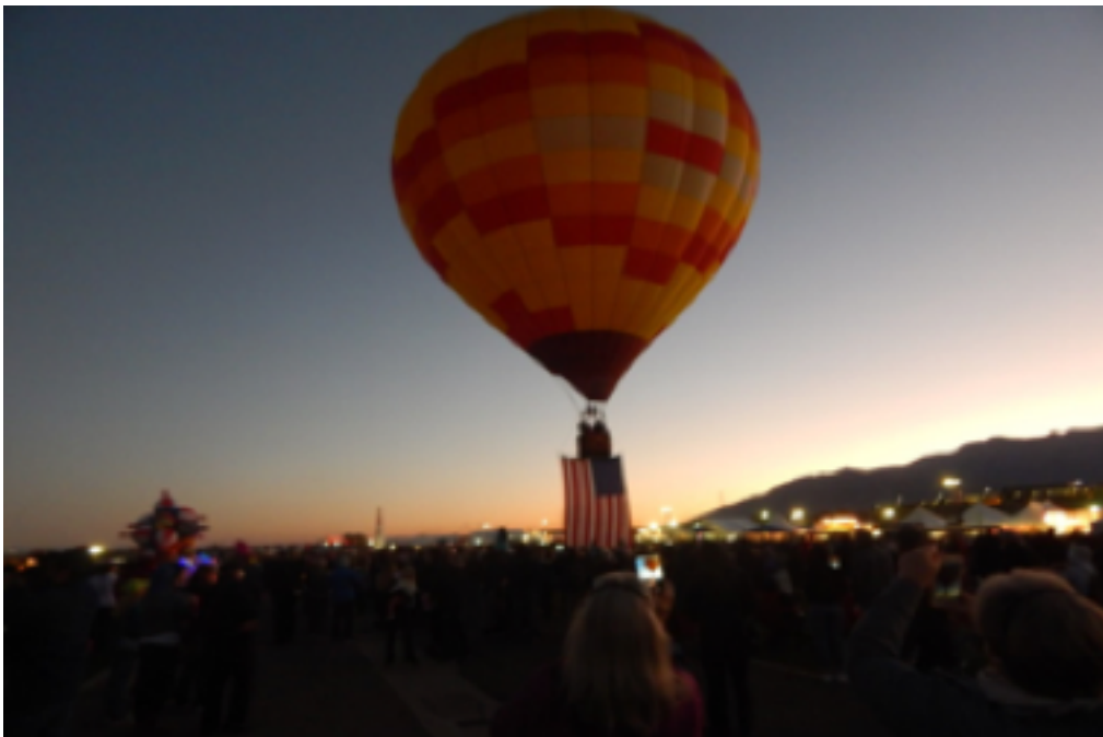
Ascent Accompanied by Singing of National Anthem