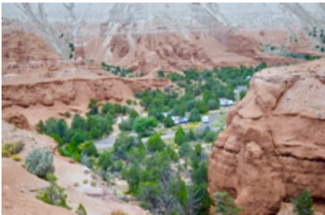
View of Campground from Angel's Palace Trail