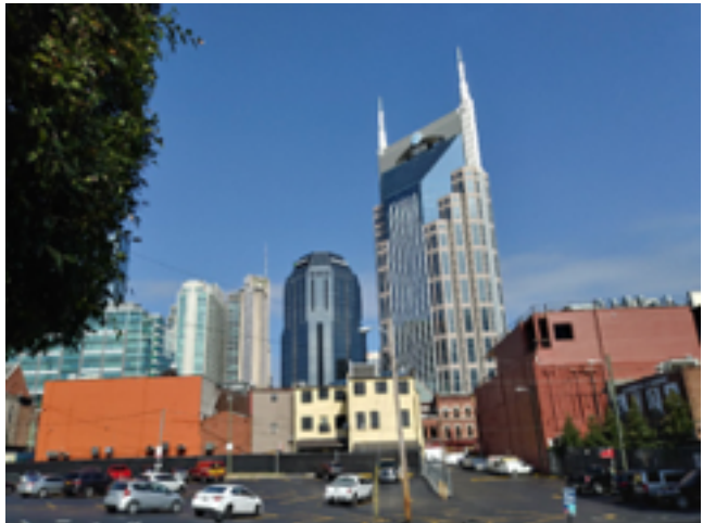
Downtown Nashville AT&T building (aka Batman)