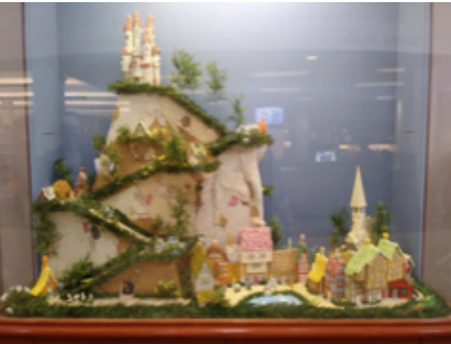
Smyrna Library display