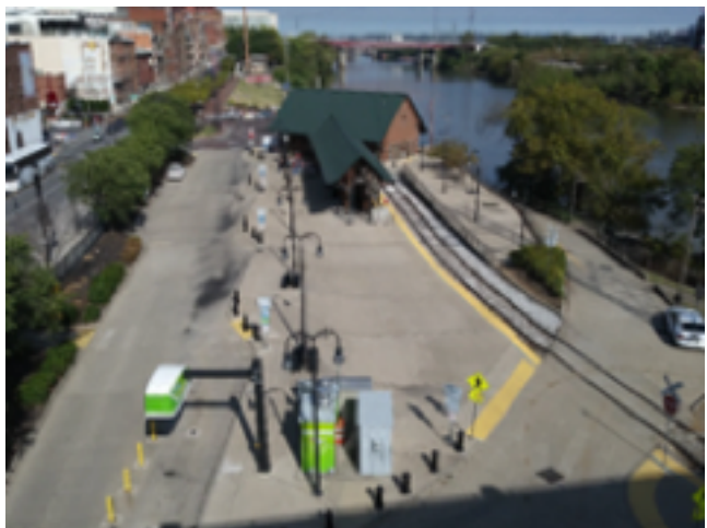
Nashville Music City Star Train Station