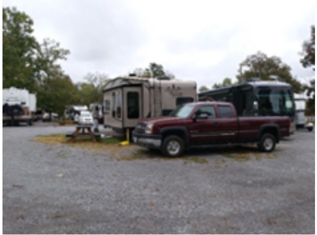
I-24 Campground, Smyrna TN (Good Sam)