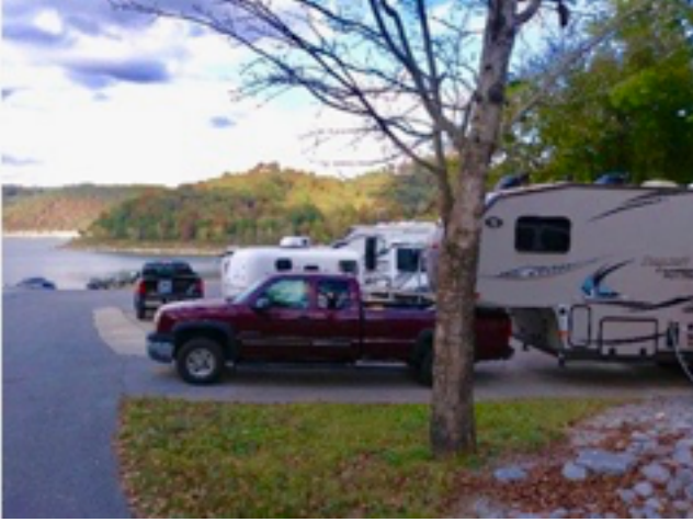
Floating Mill COE Campground, TN