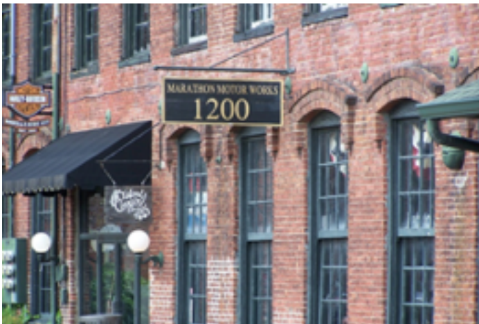
Marathon Motor Works