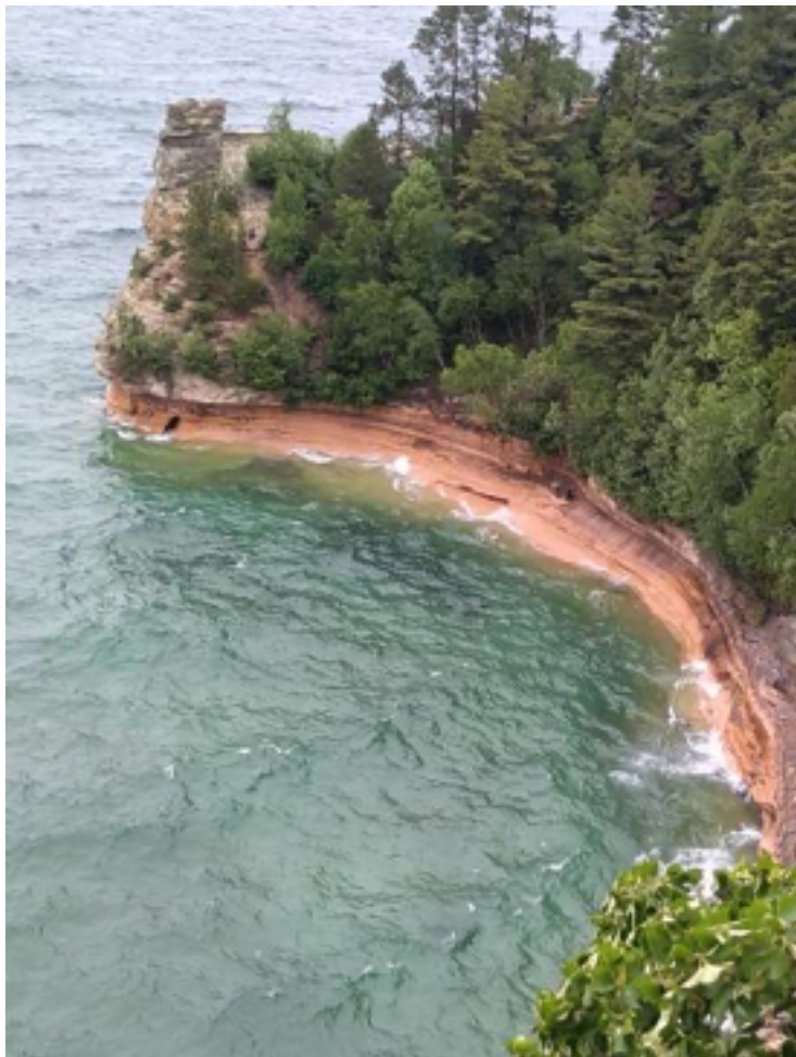
Miner's Castle at Pictured Rocks, Upper Peninsula of MI.