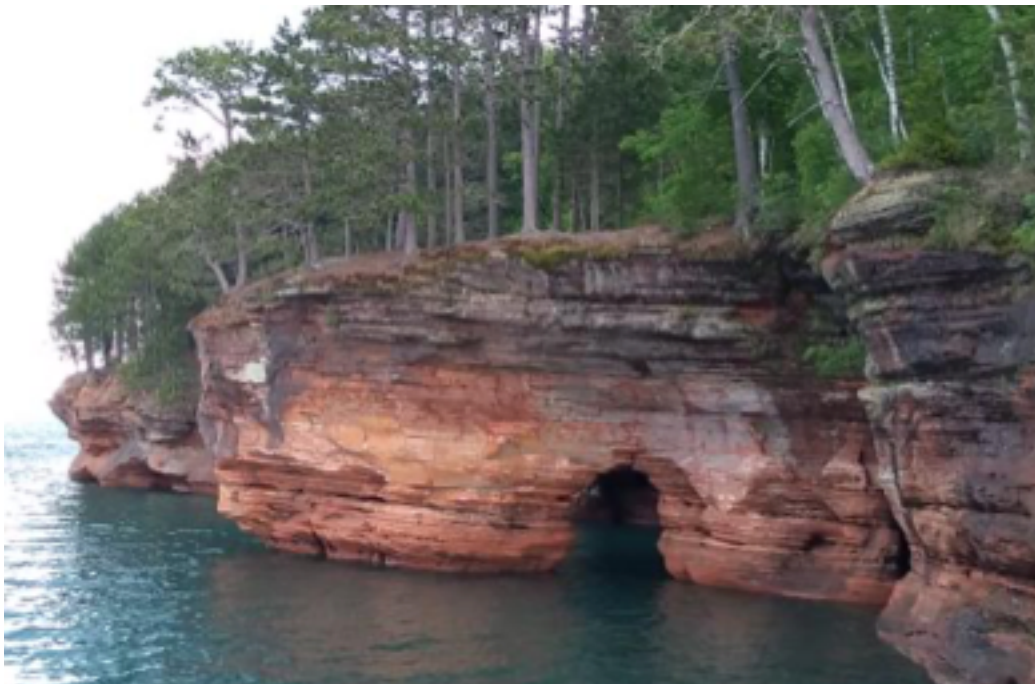
Sea Caves Apostle Islands