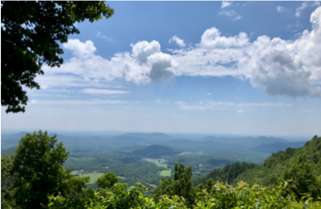
View from the Blue Ridge Parkway, NC

The last day was spent riding the Blue Ridge Parkway and it was beautiful as always. We look forward to coming back during the fall to experience the beautiful color of the leaves.