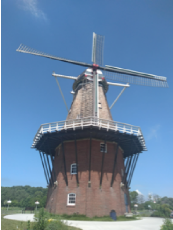
De Zwaan Windmill, Holland, MI