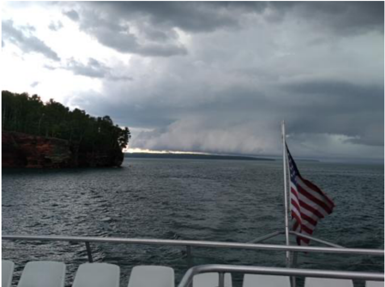
Approaching storms from Cruise boat