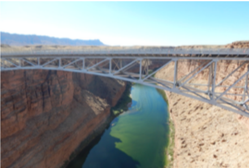
Marble Canyon/Navajo Bridge

The Navajo Bridge crosses over the Colorado River at Marble Canyon in the Grand Canyon National Park, about 12 miles southwest of Page, Arizona. The bridge is 467 feet above the canyon floor. There are actually two bridges, one for vehicles and the other for walking. California condors were flying or resting under the bridge the day I visited. A California condor release program was established in 1996 at Vermilion Cliffs National Monument, Arizona, a short drive from Marble Canyon/ Navajo Bridge on U.S. 89A.