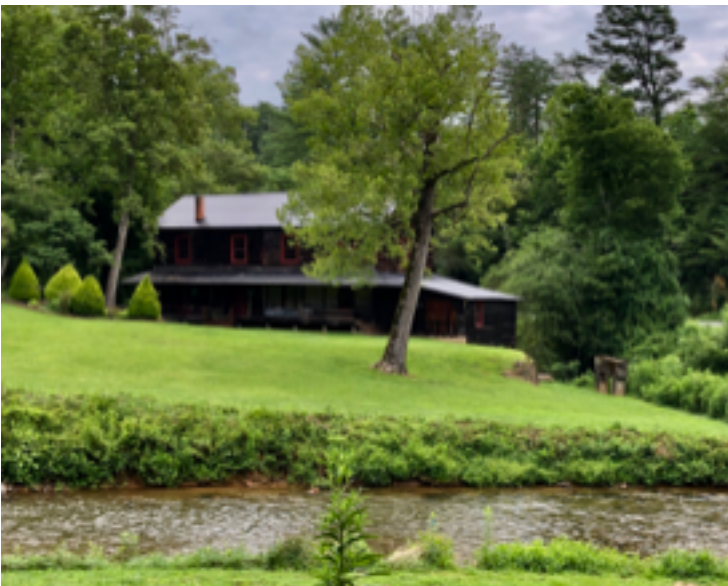
Knapps Mill, NC