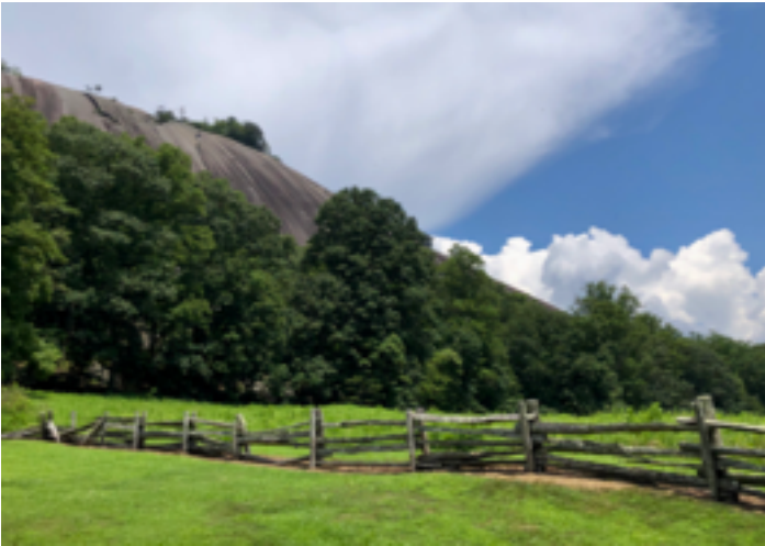
Stone Mountain, NC