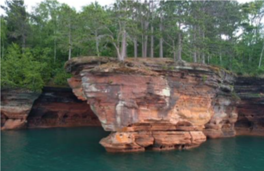
Sea Caves from Apostle Islands Cruise boat