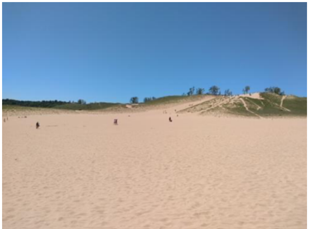
Sleeping Bear Dunes National Lakeshore, MI