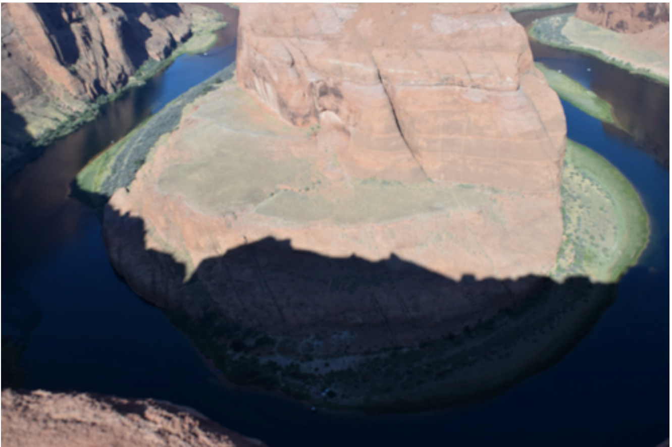
Horse Shoe Bend – Colorado River South of Page, Arizona

Horse Shoe Bend is located in the Glen Canyon, about four miles south of Page, Arizona. The Colorado River created a roughly 270 degree horseshoe shaped bend 1,000 feet below the rim where this photo was taken.