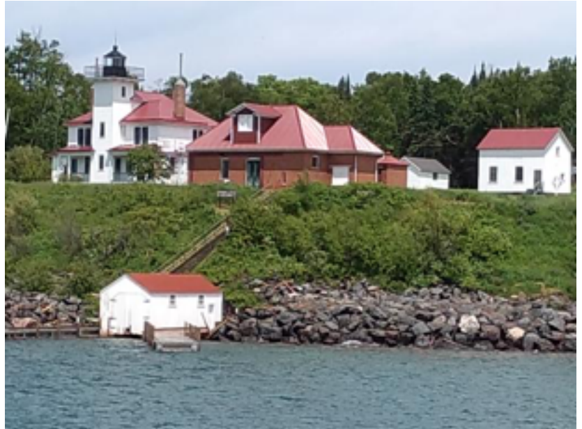
Sand Island Lighthouse, Apostle Islands, Lake Superior, WI