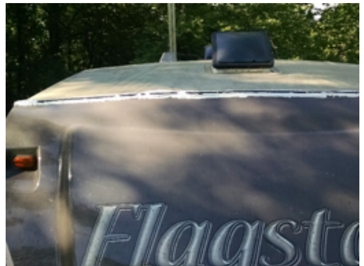
After CW/Kansas Repair 2015