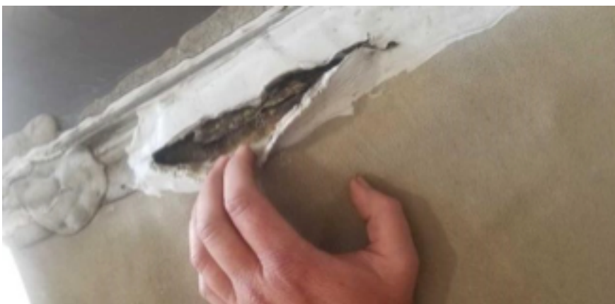
Terri Wirtz SKP #93910