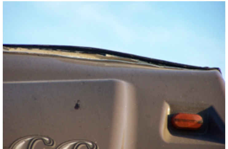
Roof Damage in Kansas 2015