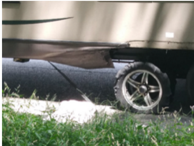
Tire Blowout and damage to fender 2020