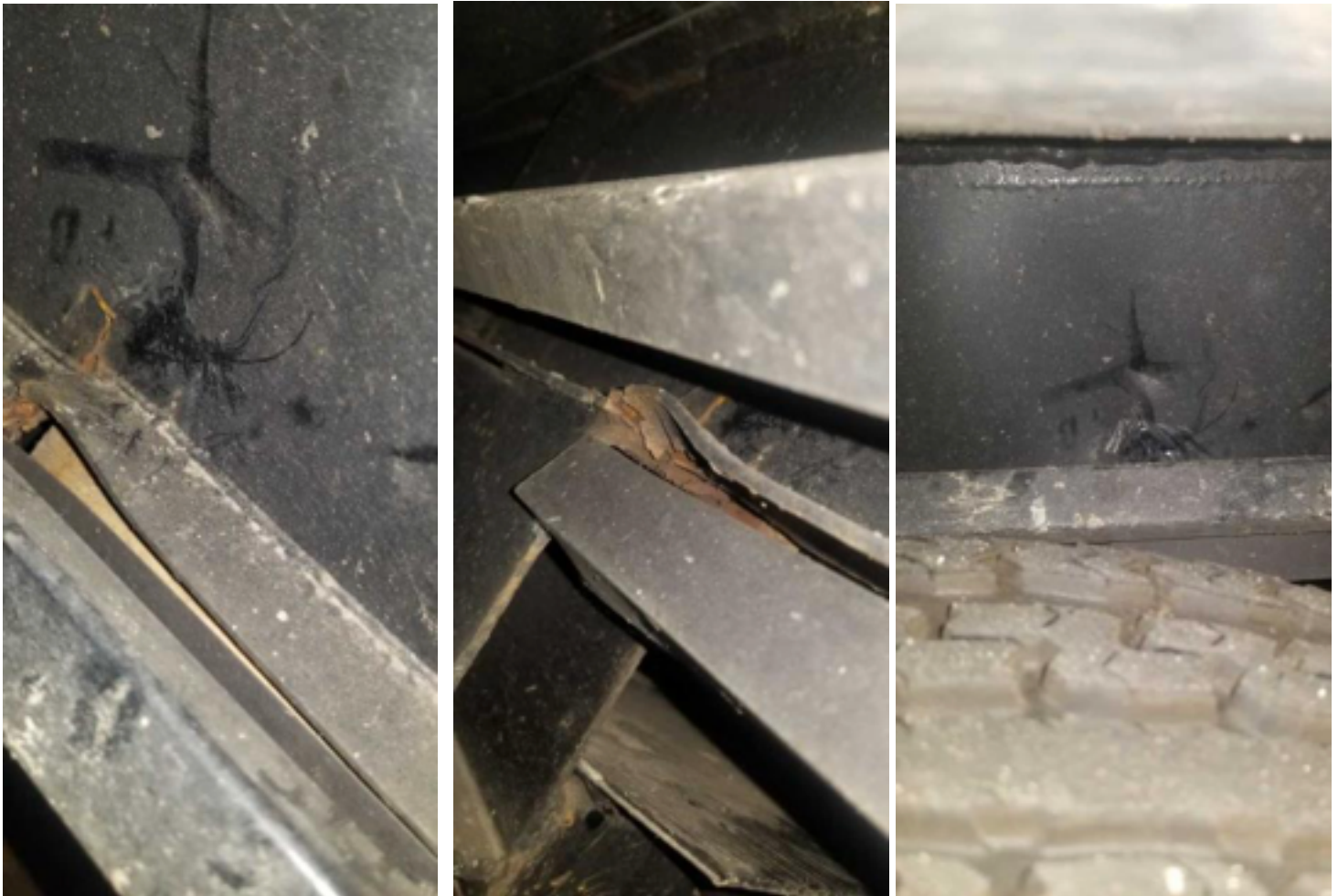
Frame Break 2020

I contacted a local lawyer a couple weeks ago to see if there was any way to recoup my costs. They were kind but did not feel qualified to handle a product liability case and suggested I try someone else in Raleigh. I am weighing my options on that. Just not sure I want to worry about having to sink more costs when I have already spent way more than the value of the trailer.