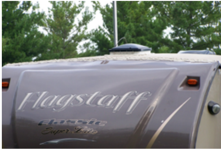
After Forest River Repair 2015