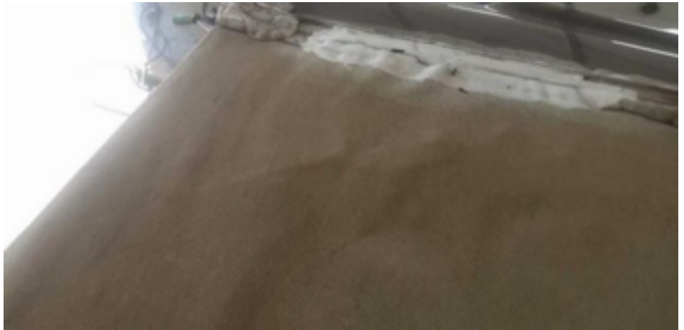
Damage as seen by Camping World / Statesville 2020