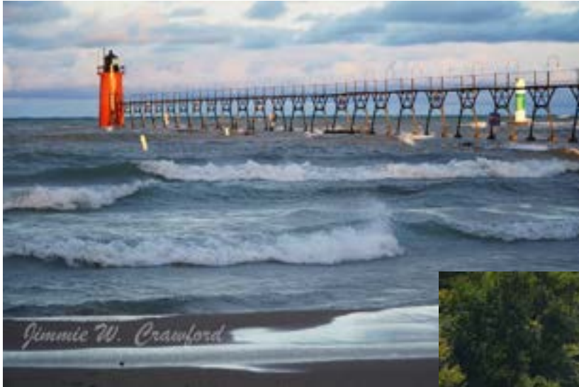
South Haven, Michigan