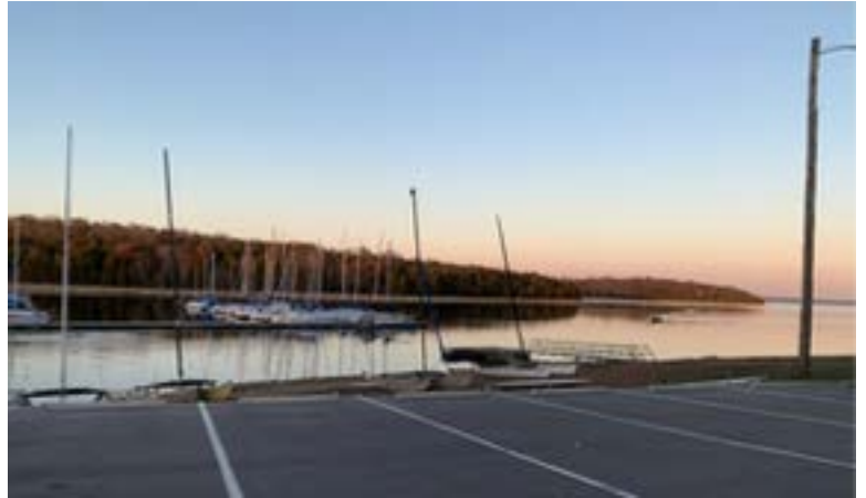
Percy Priest Lake - Nashville, TN