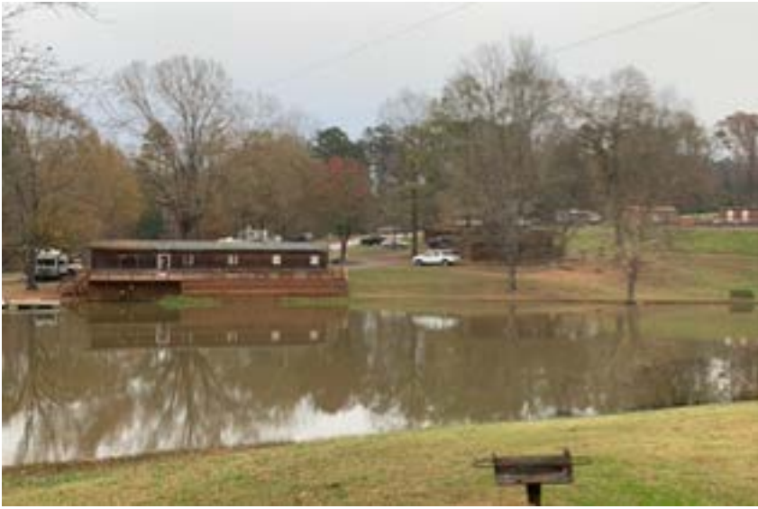
Carolina Rose Campground