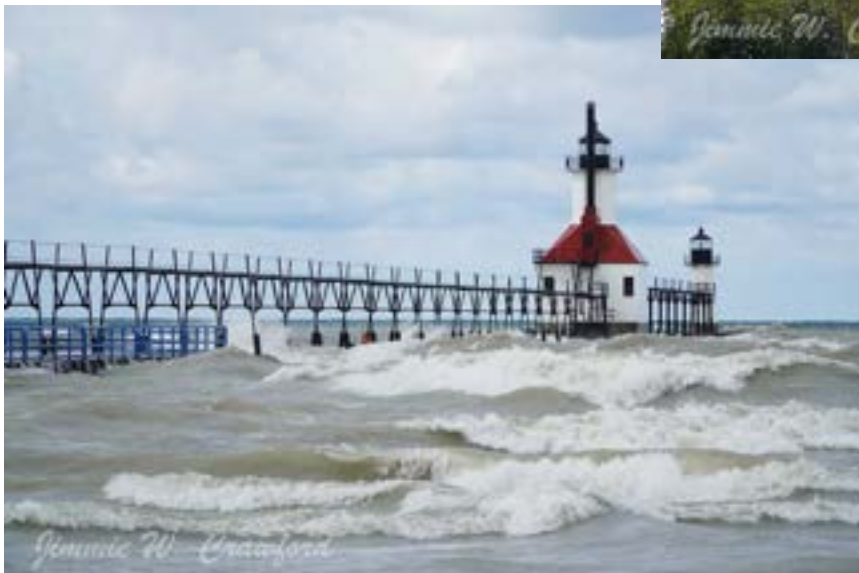
St. Joseph, Michigan