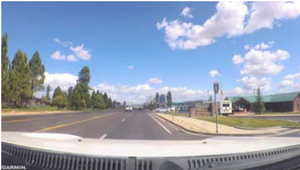
Bryce Canyon City, Utah