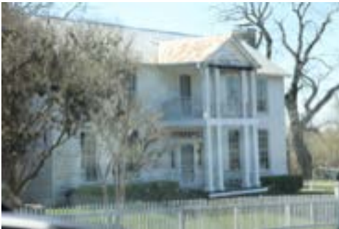
Sam Houston's home in Independence