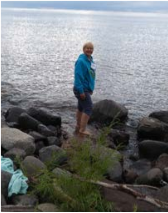
Iron County WI beach, harbor, and marina