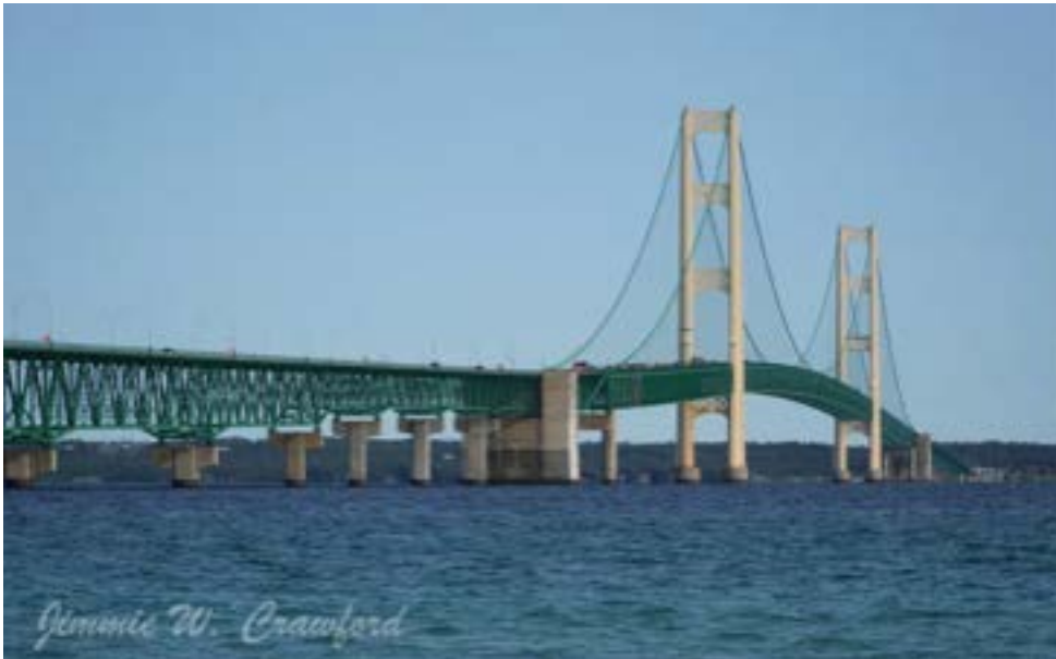
Mackinac Bridge seen from Mackinaw City, Michigan