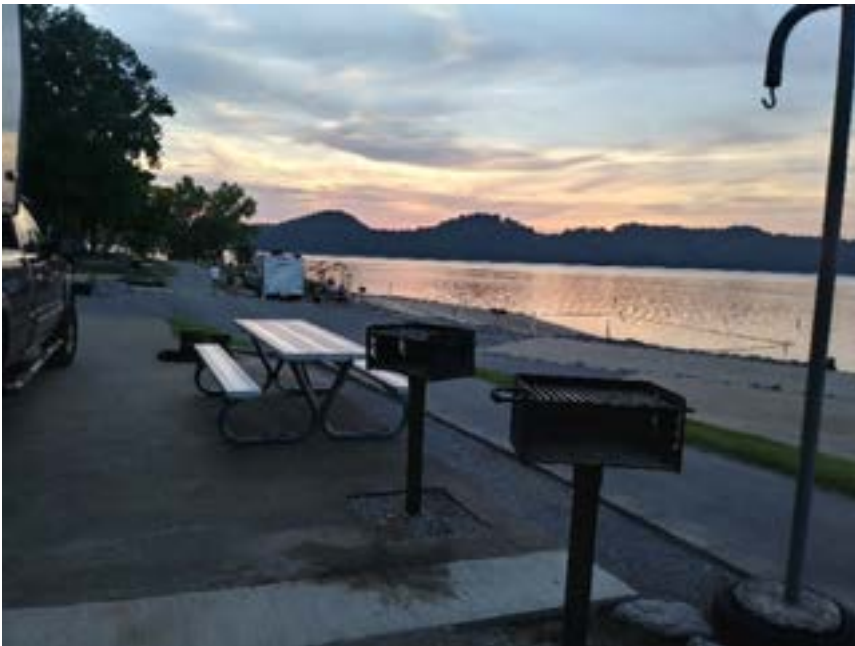
Floating Mill COE RV park, Silver Point TN