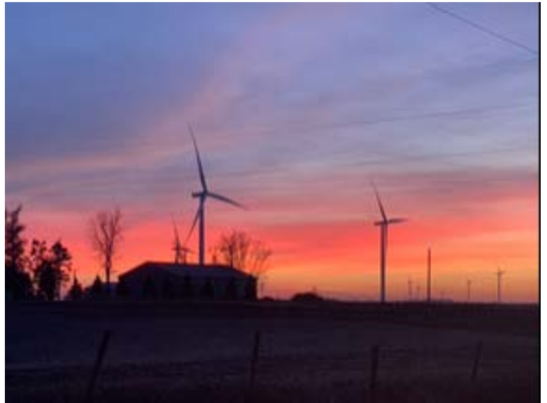
Sunset over Adair IA