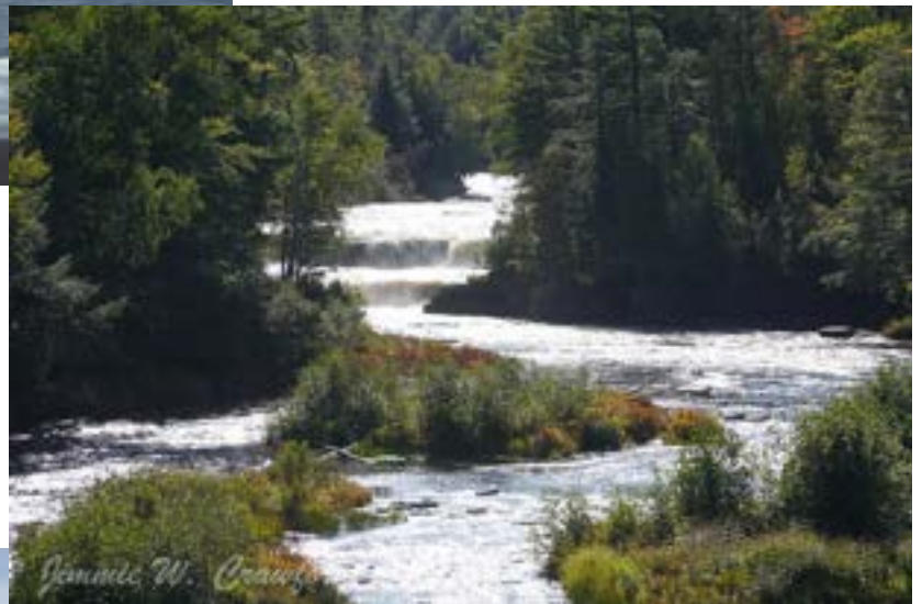
Lower Tahquamenon Falls, Paradise, Michigan