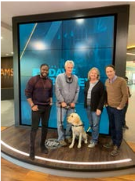
Dave Ramsey Studios Nashville, TN