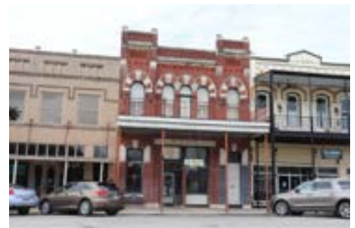
Goliad (Fannin Memorial)