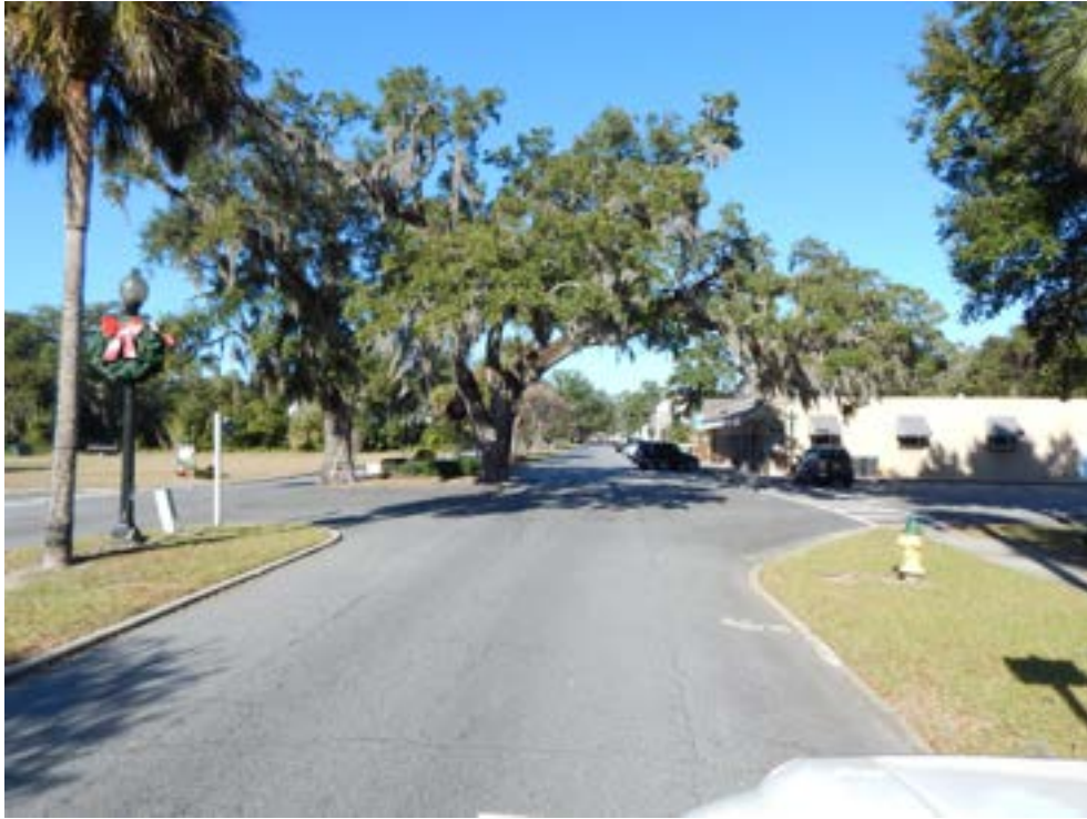
Historic Saint Marys, Georgia