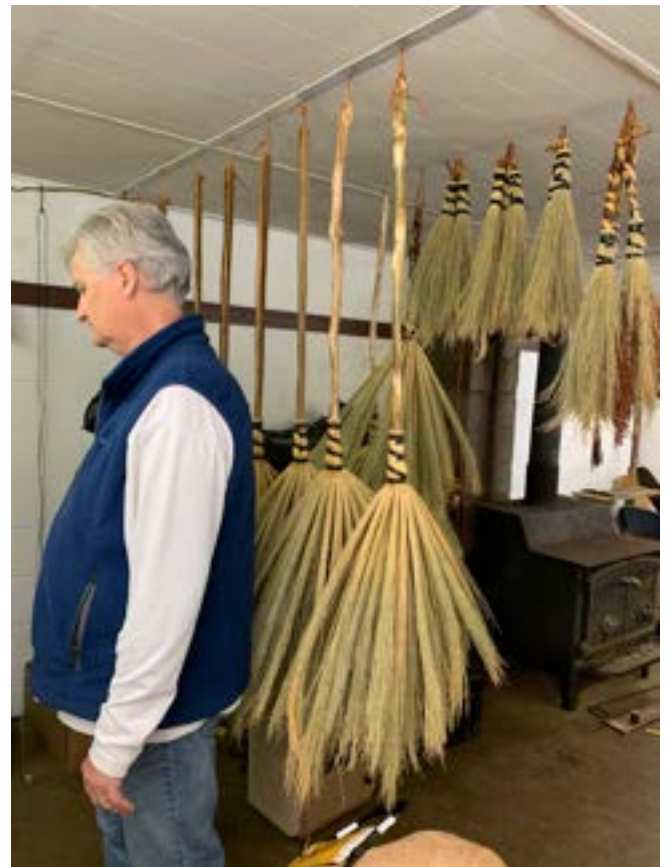
Sevierville, TN - Broom Shop