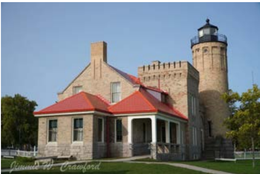
Old Mackinac Point Lighthouse, Mackinaw City, Michigan