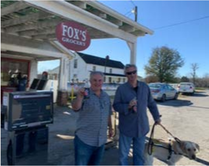
Fox's Grocery - Nashville TN