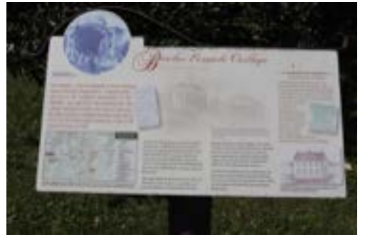
Washington on the Brazos