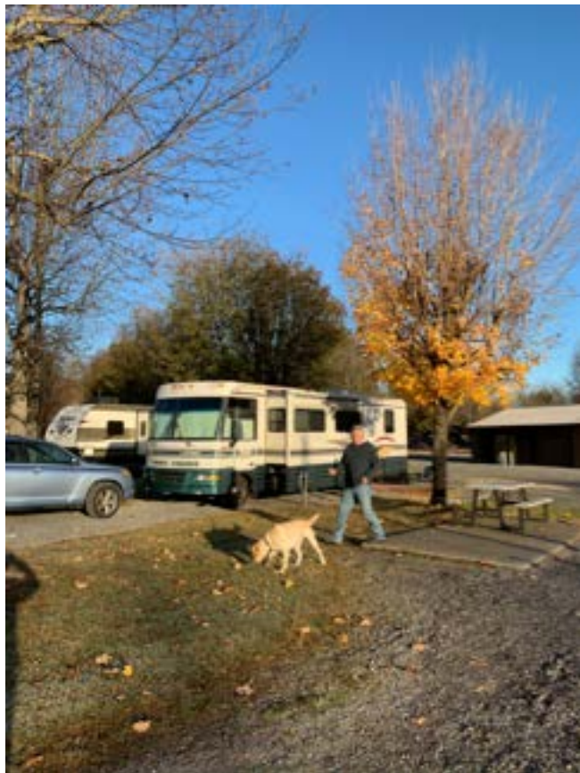
Sevierville, TN - River Plantation