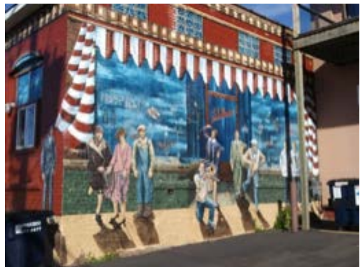
A few of the murals in Ashland WI