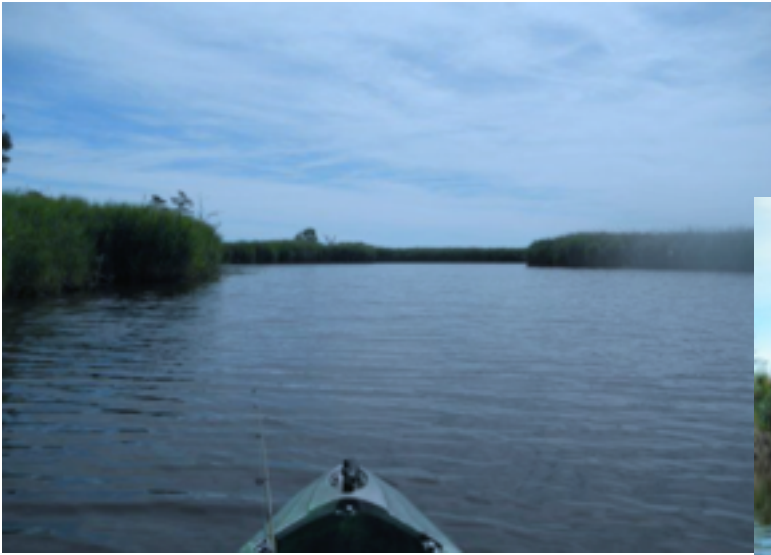
Beggar's Creek - Virginia Beach, Virginia