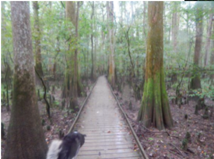
Congaree National Park – Water Tupelos