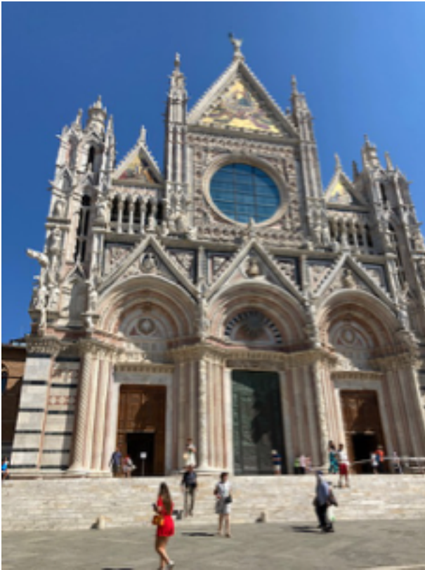
Basilica of St. Francis