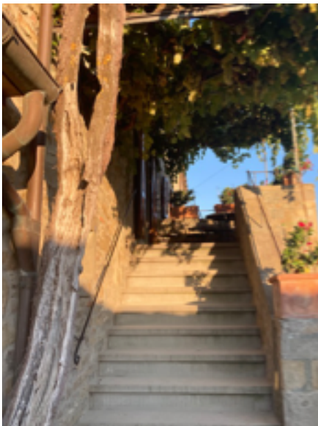
Town of Cortona & Monastery that St. Francis of Assis completed for the monks