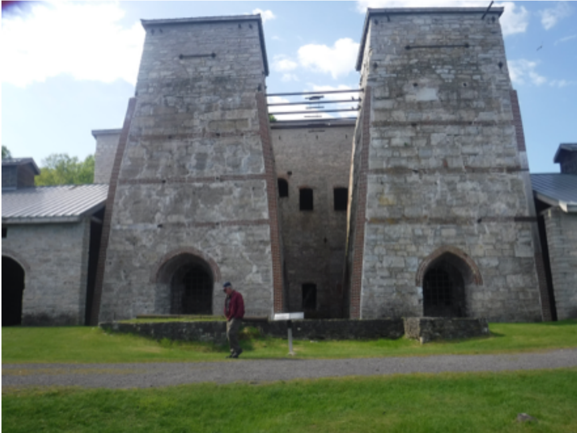
Mac & Renae Shea SKP# 78019