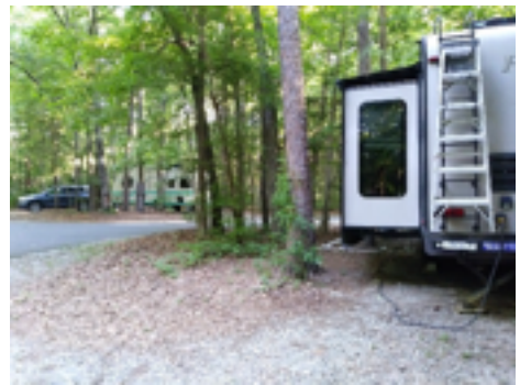
Dan Nicholas campground sites 12 and 10