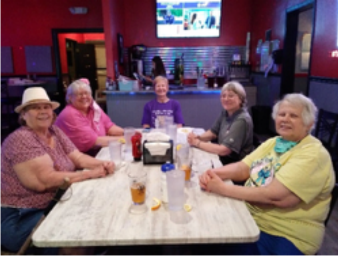
Highland Tavern, Banner Elk