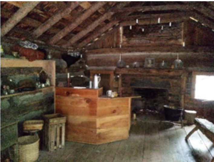
Hickory Ridge Living History Museum