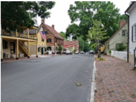
Old Salem NC