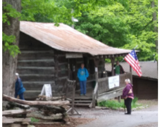
Hickory Ridge Living History Museum