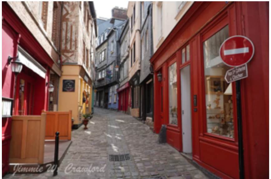
Jimmy Crawford SKP # 110674