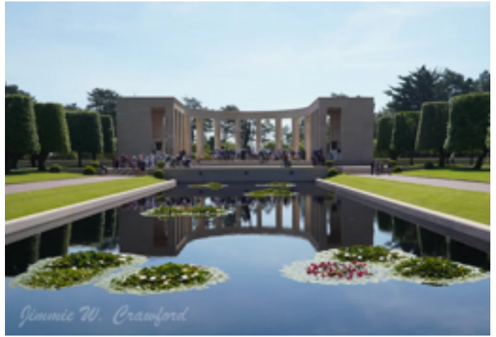
Normandy American Cemetery