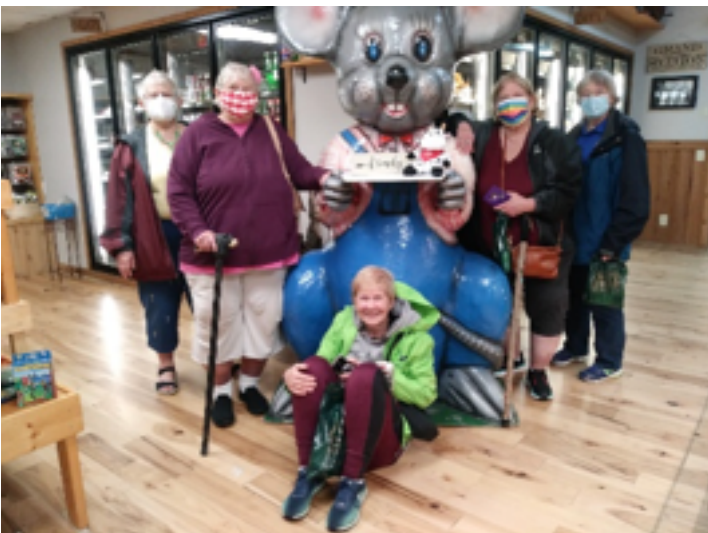
Ashe Cheese Factory